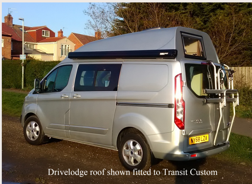
Drivelodge roof shown fitted to Transit Custom