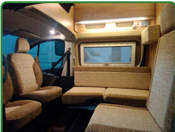
Lounge can be set up with side facing sofa...

Gas - Our gas locker holds a 6kg Calor gas bottle, these are less expensive to refill and hold more gas than the Campingas alternative, although we can supply a Campingas adaptor for use in mainland Europe.