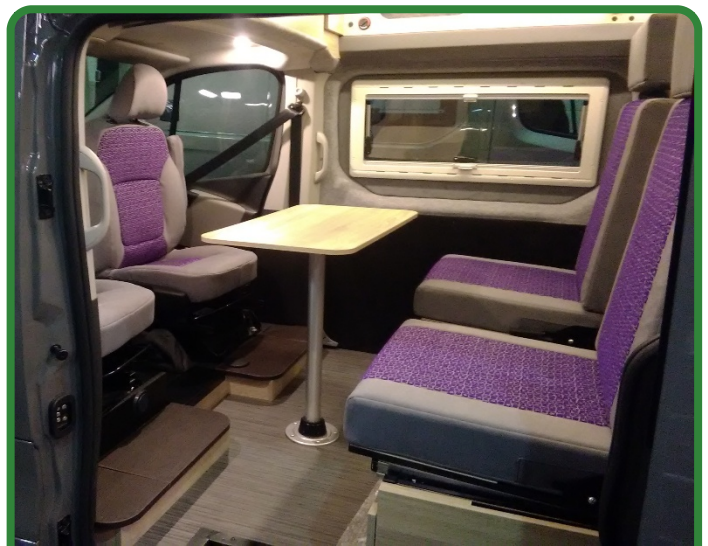
... or single travel seats